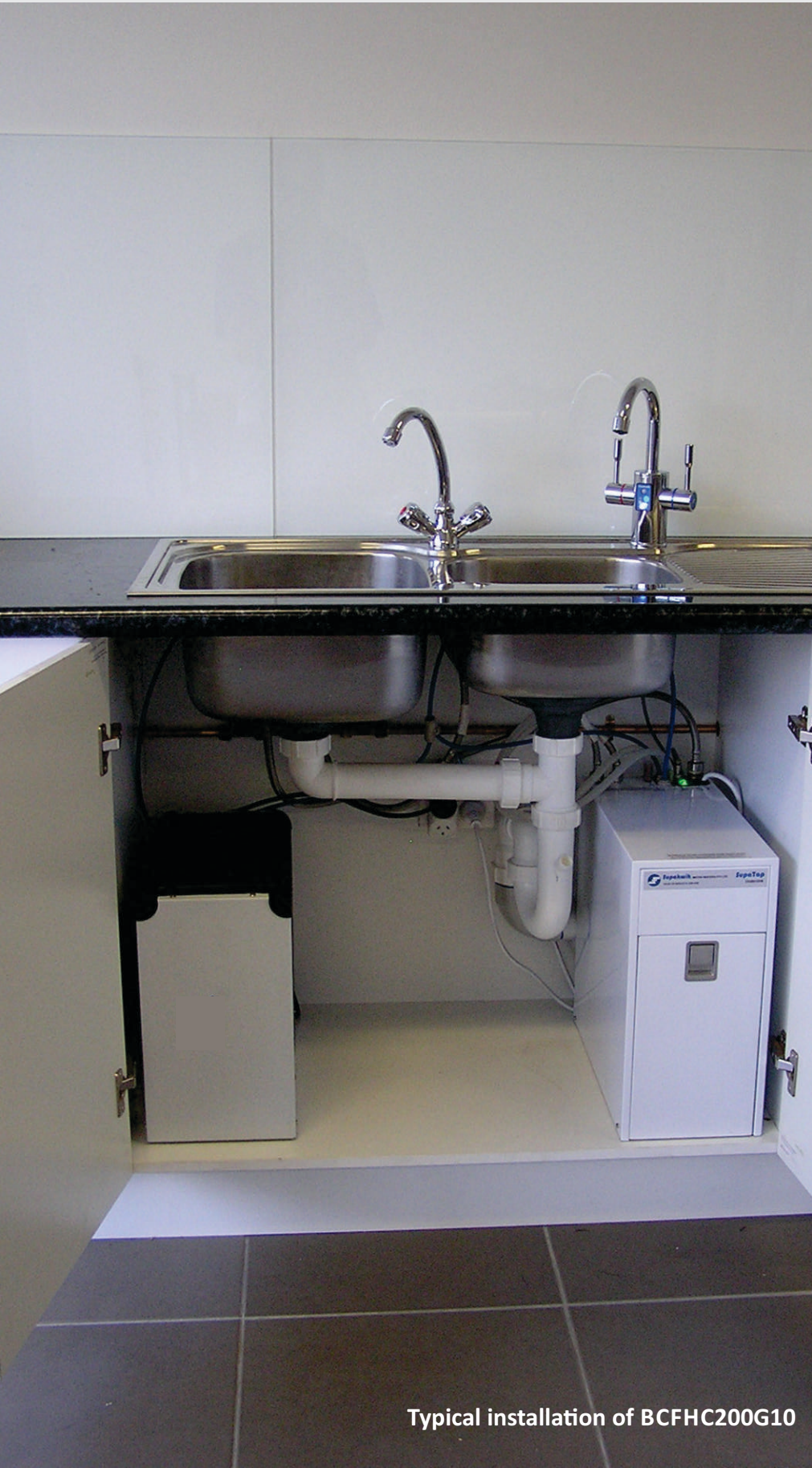
Typical installation of BCFHC200G10